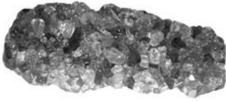
— Fireglass (2" depth for propane)