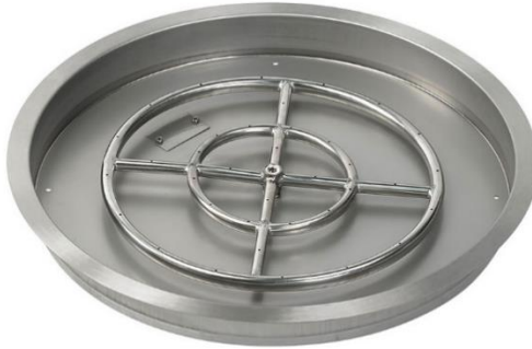
— Burner Assy.