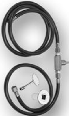
— Exit Gas Hose (To Air Mixer if Propane)